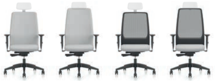
Swivel chair, upholstered, low