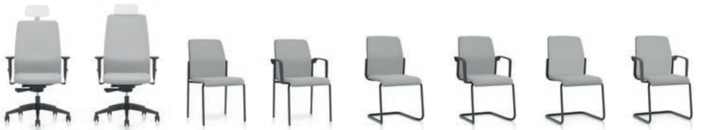
Swivel chair, Chillback, low